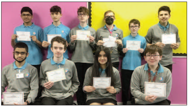
MATHEMATICIANS HONOURED: Some of the Year 10 students who received UKMT certificates.