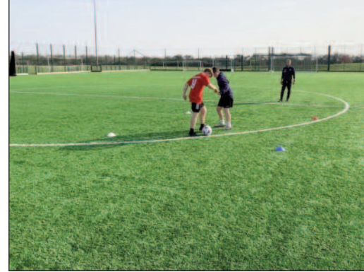
LEARNING TO COACH: Students at the Football Leadership Academy.

While there are many girls who already play football at Cam VC, the football activators are hoping to get many more girls involved in their upcoming sessions. Keep an eye out on the PE notice boards for some more information!