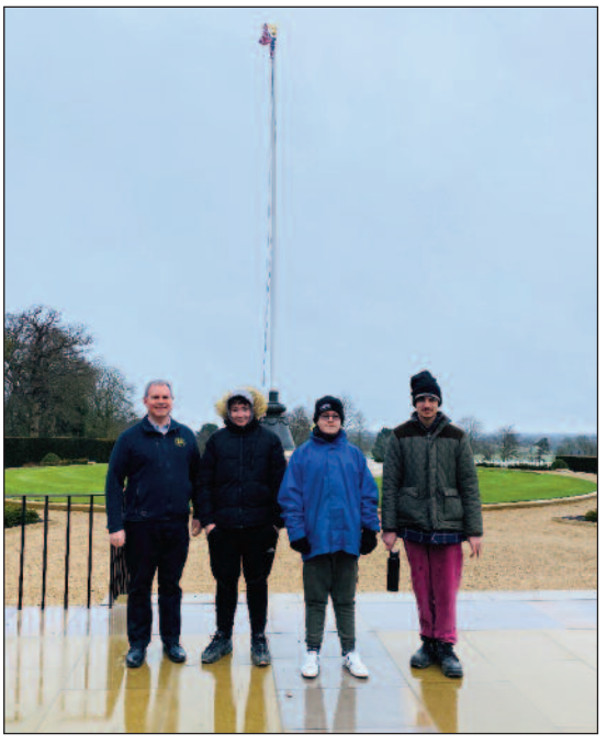
HORTICULTURE EXPERIENCE: For three students at the American Cemetery.

"The lawnmowers are specially adapted so that the blades are able to get underneath the grave stones without damaging them. A chip to one of the grave stones costs £2000 to replace!"