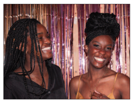
KEY ROLES: The hosts also had a big part in the planning of the event.

So watch this space for upcoming events, and for the podcast we intend to launch after Easter.