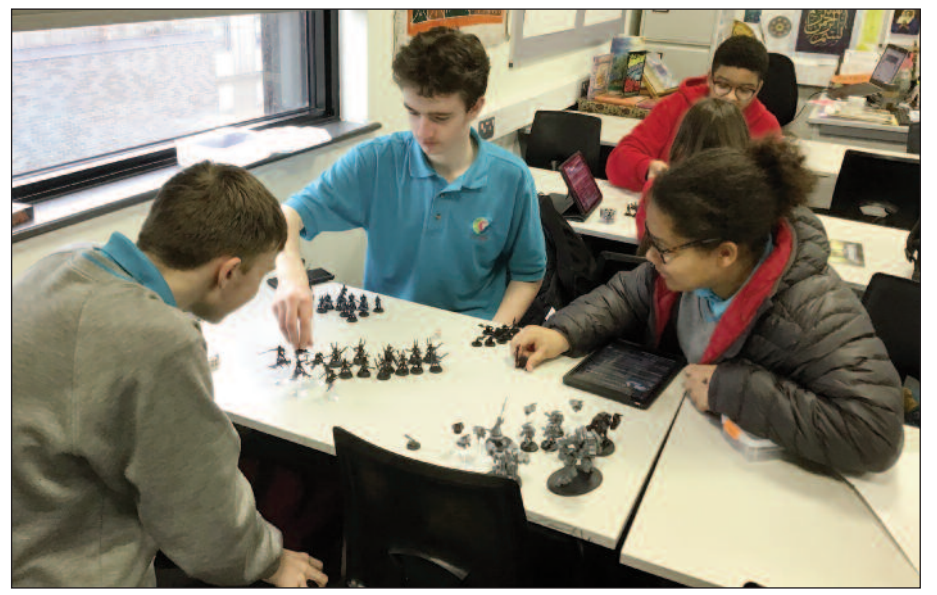
FULLY ENGAGED: Students enjoy meeting weekly to create models, play games and discuss tactics at the new Warhammer Club.

One student described the club, stating: "Warhammer is many things. It is a universe filled with over 400 billion stars. It is a never-ending story and a home for all...it is a game which anyone can play and be a part of. (This club) allows students to play and enjoy the magical game."