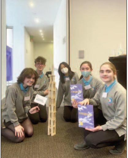
on a product that was judged to be "very creative and innovative" with "fantastic" packaging. As one judge put it, it is "a product ready to go on the market". We now need to wait for the winning team to be announced at the Design Ventura Celebration & Awards Event at the Design Museum on 28 April 2022. We are keeping all of our fingers crossed! This had been an incredible opportunity for the

"Eco Seed is a small floating device with a centre grid allowing you to propagate seeds without soil, enabling you to watch the roots grow through a clear container such as a glass or bowl of water. "In the world we are currently living in, design is