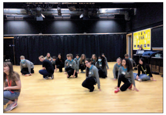
WORKING TOGETHER: Year 8 pupils and Drama students from Anglia Ruskin University.

The Year 8s have been diving into all their favourite books so that the ARU students can work their magic and create a one-off show just for us! They will be working tirelessly to create and rehearse the show ready to perform to Year 8 in May and we can't wait to see the outcome!