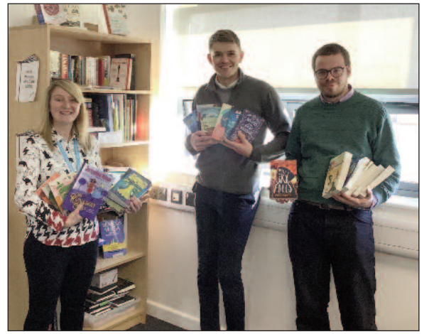
READ AND REVIEW: Titles in the Young Quills competition for historical fiction.

I can't wait to read some more of your books. It was very generous of you to give up your own time and I would like to find out more about ancient history. Thank you."