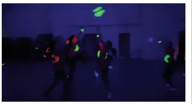
WINNING IDEA: The Dragon's Den winning pitch for a Glow in the Dark Club has become a reality.